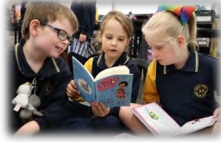
Inclusion, Tolerance & Understanding