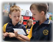
Respect & Care

401 Dana St, Ballarat. Phone 53321 301 email: ballarat.ps.dana@education.vic.gov.au